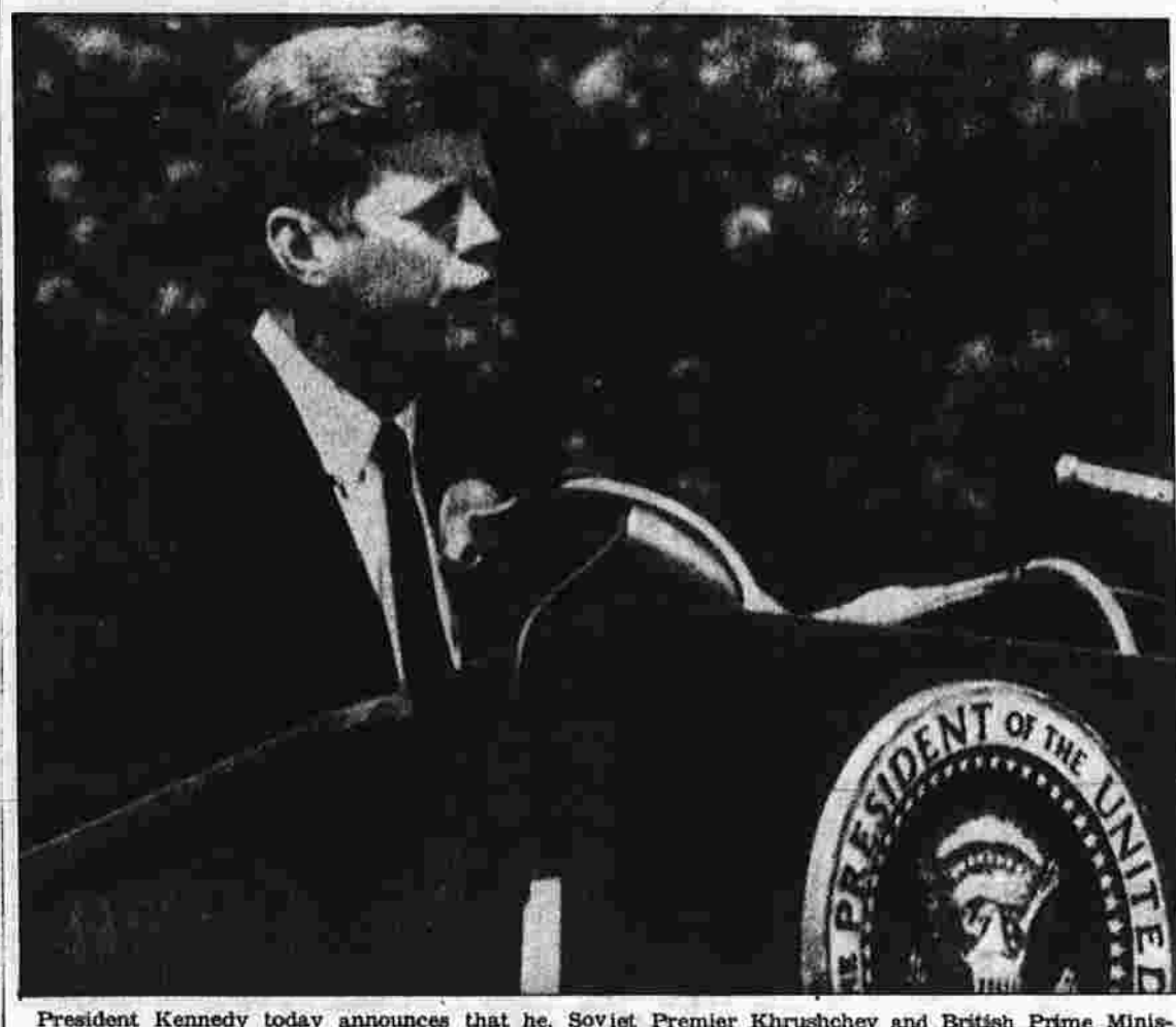
President Kennedy today announces that he, Soviet Premier Khrushchev and British Prime Minister Harold Macmillan will send special negotiators to a mid-July conference in Moscow for a new try at writing a nuclear test ban treaty. Kennedy made the announcement in a speech at American University in Washington.